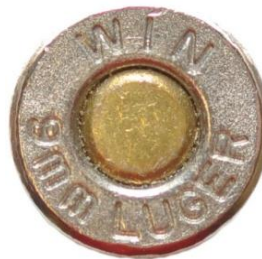
Winchester Q4364 9mm identification

Intranet Web: https://insight.ice.dhs.gov/Pages/default.aspx