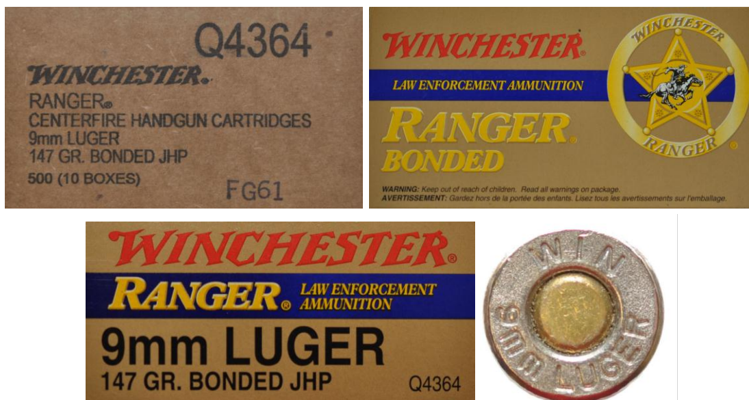
Winchester Q4364 9mm Identification

Changes to the list of authorized personally owned weapons resulted in an increased demand for 9mm ammunition in 2011 and 2012. This increased demand depleted available ammunition inventories as well as ammunition available for purchase through NFTTU contracts. As an interim solution, NFTTU purchased Winchester 9mm 147-grain (part number Q4364) duty ammunition through another Federal agency's existing contract. Multiple failures to fire have been reported with this ammunition and it does not meet NFTTU quality and reliability standards for duty ammunition. Therefore, NFTTU has determined that this ammunition is no longer suitable for duty carry and should only be used for training and qualifications.